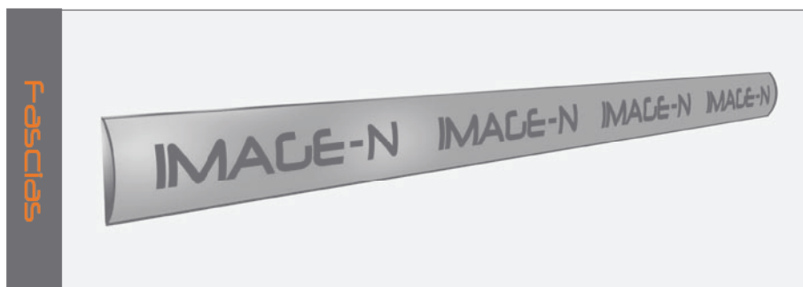
Image-N3 can be used to produce lightboxes or curved graphic holders for flat or curved fascias, the curved versions being ideal for back lighting.

Continuous fascia fronts of over 50 metres can be produced using this system.