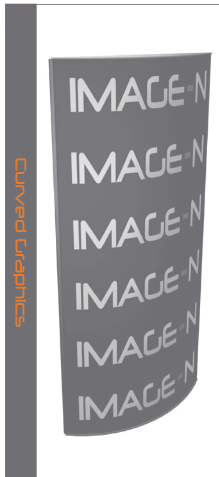
Image-N3 can be used to produce lightboxes in a wide range of sizes and front panel insert configurations for permanent or easy change uses.

Continuous fascia fronts of over 50 metres can be produced using this system.